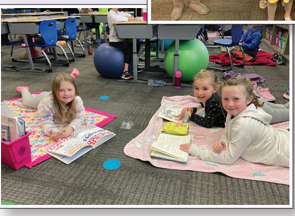
Sunny smiles with friends at Brown!