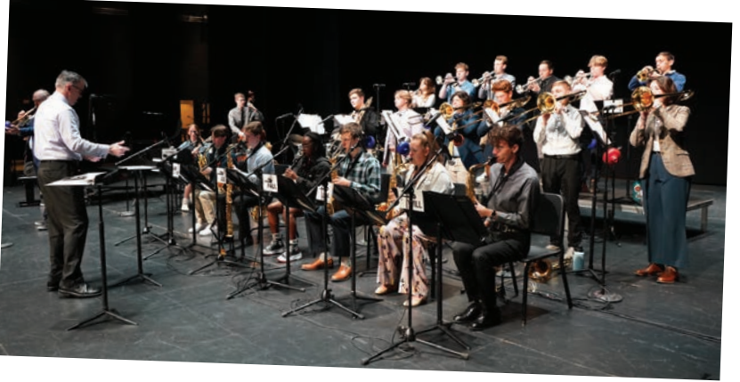
Jazz Orchestra practicing for performance