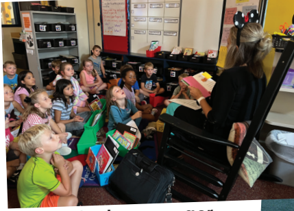
Students are eager to listen and learn