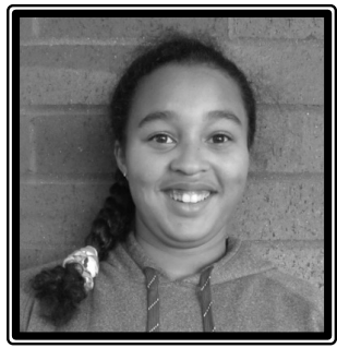
"I like to read, stay inside, and drink hot chocolate."