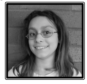
"I like to go outside and build snowmen."