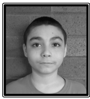
"I like winter because I can stay inside a lot and play video games."