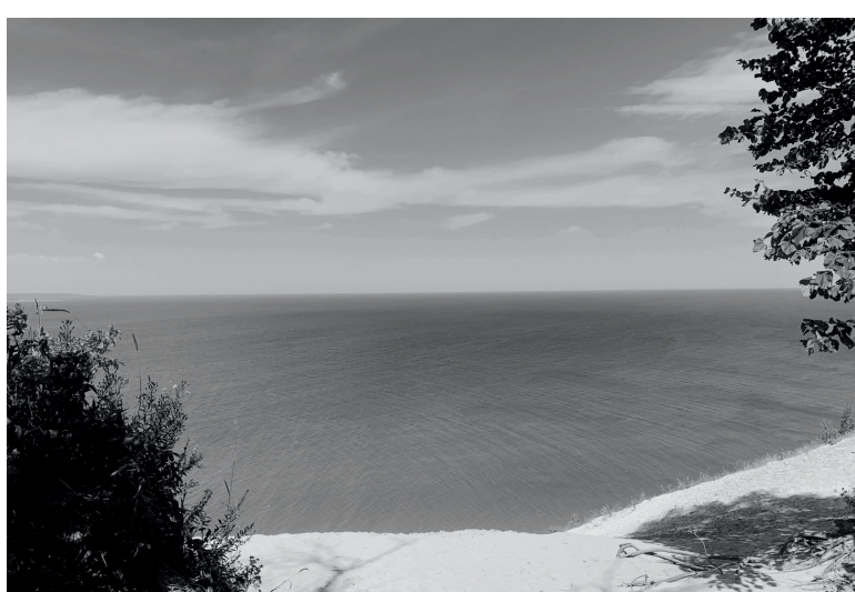
'Summer at Lake Michigan