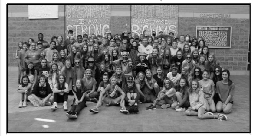
Blue Against Bullying Tuesday