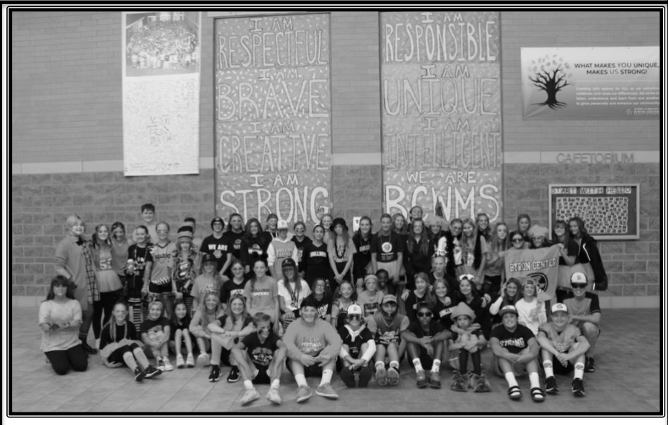
Above: BC Spirit Day on Friday for Homecoming Week. More Spirit Week Photos on Page 4