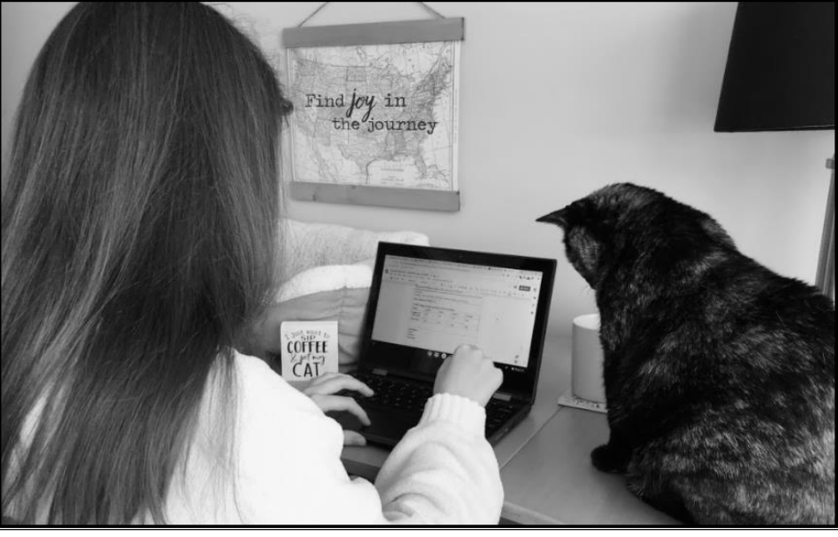
See more pictures of Virtual and Remote Learning on Page 5.

Even though this year started out different than last year, and may end different than last year, one thing that is the same is that it has been great to see friends and learn new things.