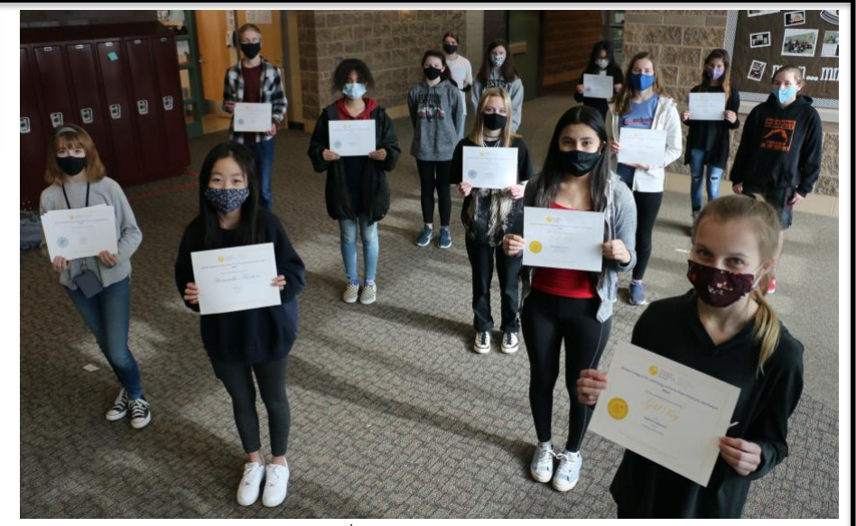
WMS Students were celebrated on March 6<sup>th</sup> for the 2021 West Central Michigan Scholastic Art and Writing Awards. Go to page 5 to read more about the winning works.