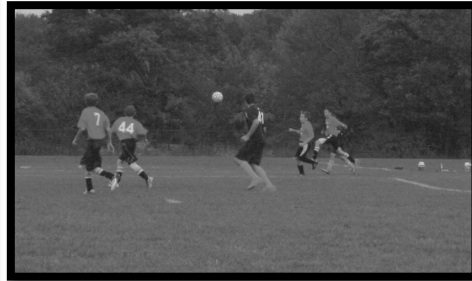
The 7th grade Soccer team works their hardest in a game against Hudsonville.