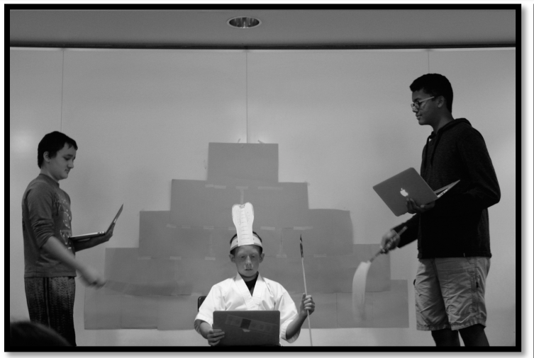
7th grade students performed skits in History to show what they learned about Ancient Egypt.